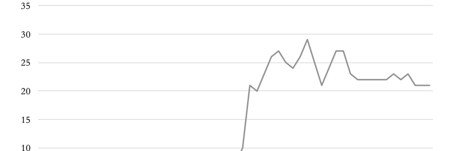
Figure 1: French use of military force abroad since 1962 (no. of operations)

A look at macro-level historical and geographical trends in military deployments illustrates the strategic priorities of French elites. To begin with, a cursory look at the number of French military operations of all types undertaken since 1962 indicates that Paris has not shied away from using military force since the end of the Cold War (figure 1).